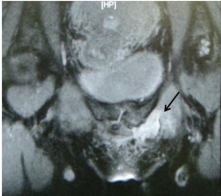
FIGURE 1: High signal changes in left superior pubic rami indicating bone oedema secondary to avulsion of the adductor longus tendon from its origin.