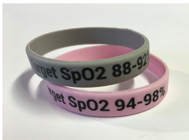
Fig 1. Colour-coded silicone wristbands. Pink = target oxygen saturation of 94–98%; grey = target oxygen saturation of 88–92%.

27 The quality improvement project ran for 16 weeks, supported 28 by the East Midlands Respiratory Programme and funded 29 by a 2014 East Midlands Academic Health Science Network 30 innovation award. A risk assessment was carried out at each 31 site and the project approved by the relevant local governance 32 committees. A key governance issue raised was potential 33 overlap of the colours proposed with existing bands at each 34 of the hospitals involved. Following discussions with local 35 governance committees, the colour choice of the wristbands 36 was agreed across the three sites (Fig 1). Methods for data 37 collection on adverse events were also agreed. 38 39 40 41 42 43 44 45 46 47 48 49 50 51 52 53 54 55 56 57 58 59 60 61